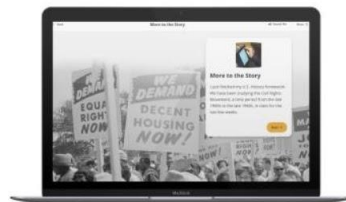
Lesson 1: More to the Story