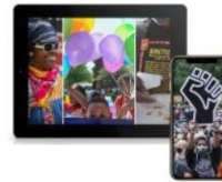
306: Continuing the Story is Mobile-Friendly

Standards Alignment: C3 Social Studies Standards, Common Core State Standards in English Language Arts and College and Career Readiness